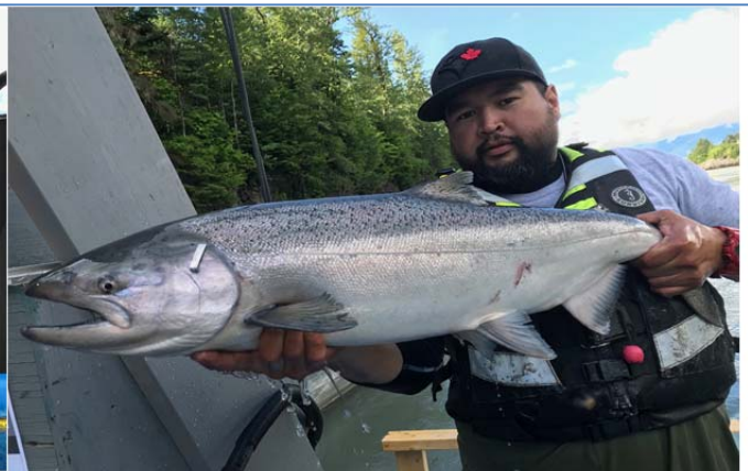
Photo 2. Chinook Salmon caught and tagged at Gitwinksihlkw fishwheels on 5 June 2018.