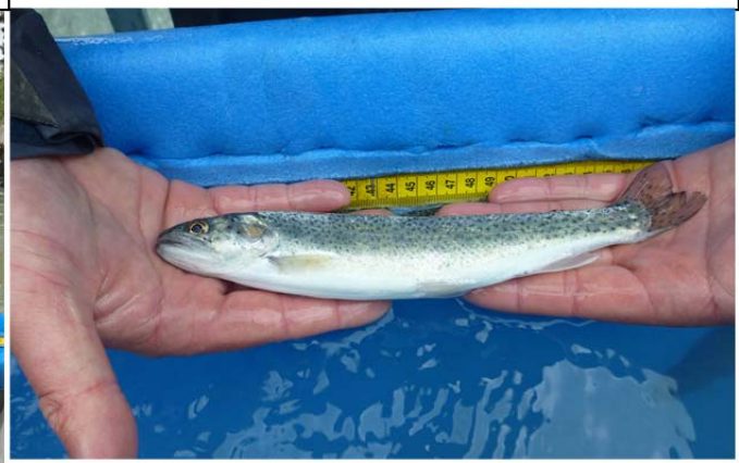
Photo 4. Cutthroat Trout caught at Gitwinksihlkw fishwheels, 14 June 2018.