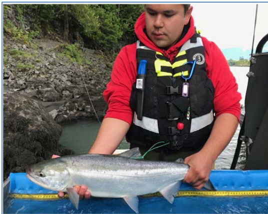
Photo 1. Sockeye Salmon caught and tagged at Gitwinksihlkw fishwheels on 11 June 2018.