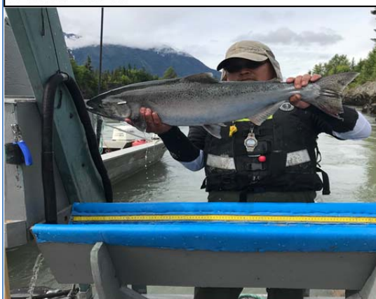
Photo 3. Chinook Salmon caught and tagged at Gitwinksihlkw fishwheels on 4 June 2018.