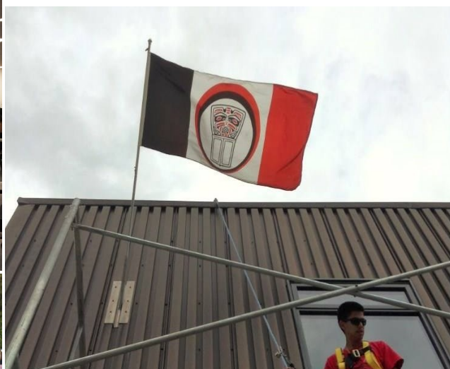
Above: Re-installing the Nisga'a flag on the Nisga'a Hall