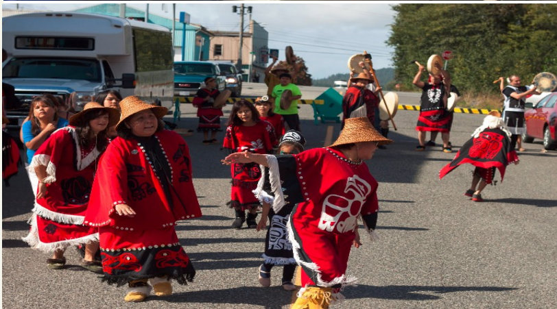
Bottom Left: Dancers entertain the crowd outside the Hall

OPEN HOUSE SUCCESS! On Sept 8th, we celebrated all the recent improvements to the Nisga'a Hall. Many thanks to everyone who helped out. We had a turnout of over 400 people!