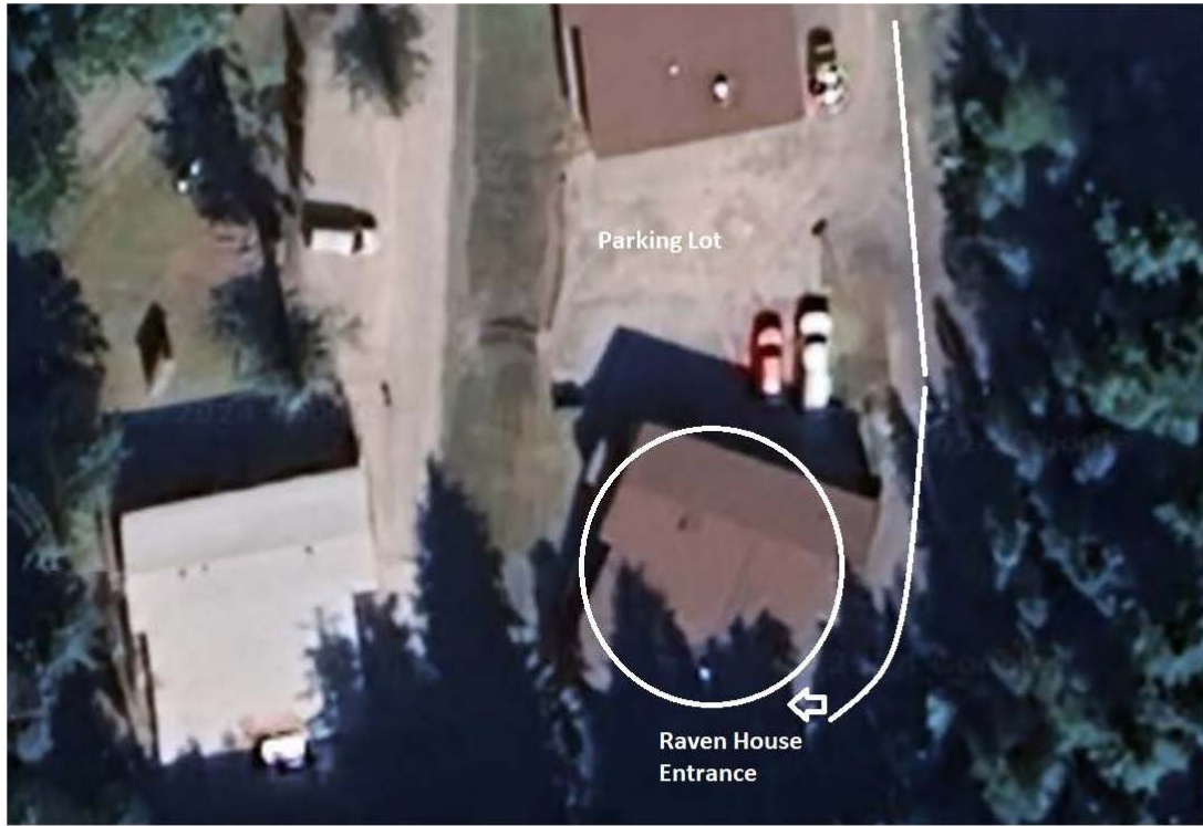
This photo shows where to find our front entrance.